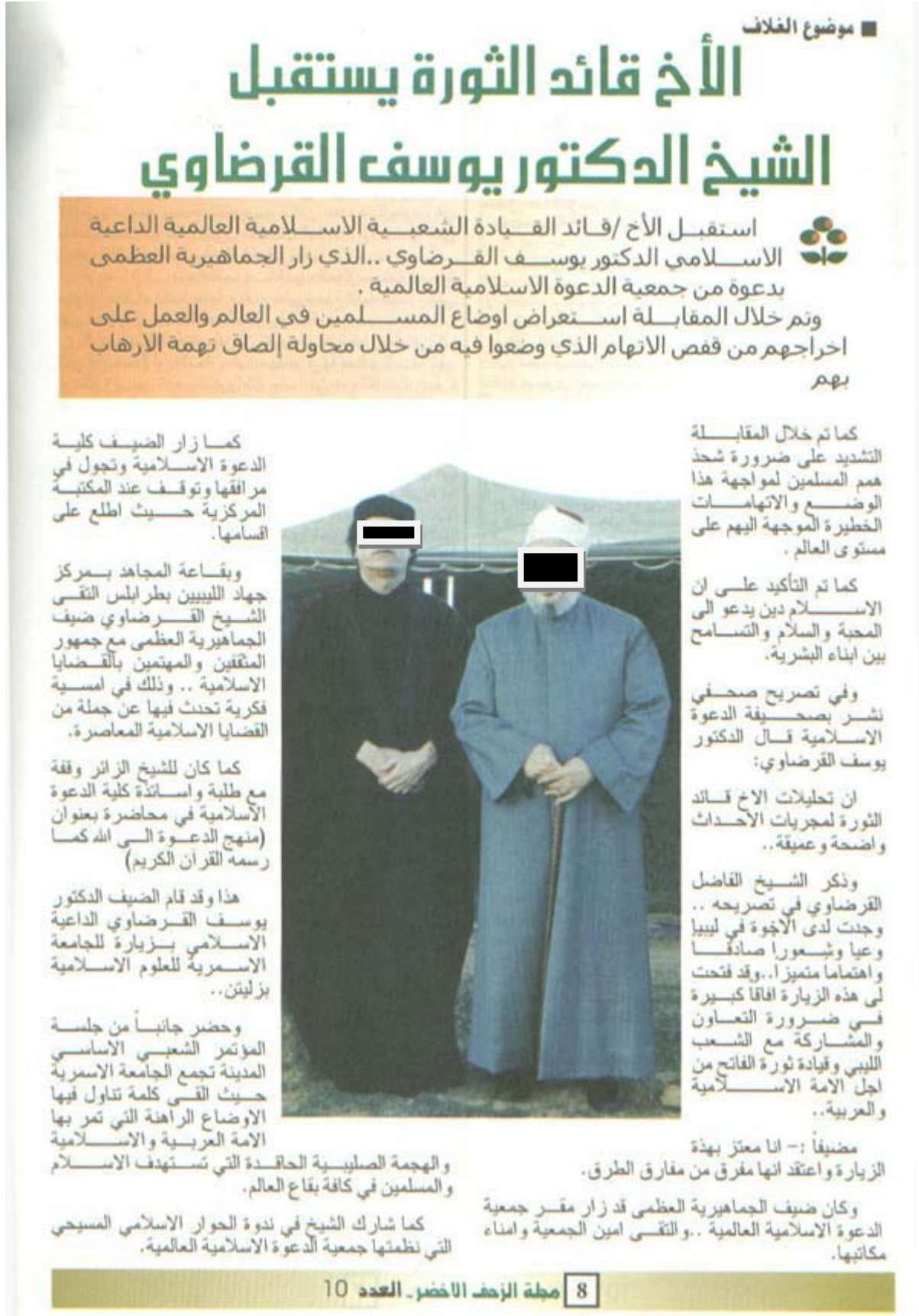
Figure 1 [Qaradāwī and Colonel Qaddafi?!]