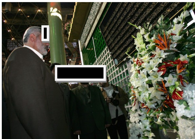
Figure 6 [Ismail Haniyeh of Hamas at the Grave of "Ayatollah" Khomeini]

Are they Murji'ah according to you due to that? Do you view them as Murji'ah because they do not make takfeer of those Rawāfid? Or is this ruling [of being Murji'ah] only applied to Ahl us-Sunnah, the Salafis? Allāh's Refuge is sought.