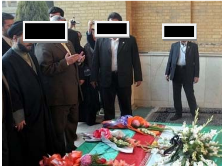
Figure 4 [Ismail Haniyeh of Hamas Making Du'a at the Grave of "Ayatollah" Khomeini! 2010]