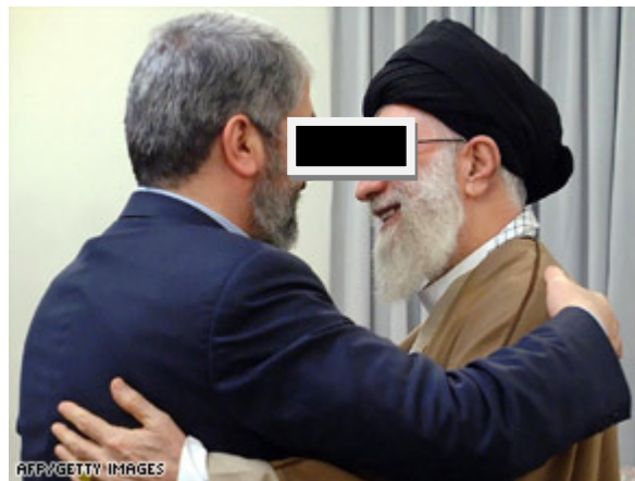
Figure 5 [Hamas Leader Khālid Mesh'al with "Grand Ayatollah" Ali Khamenei, February 2009]