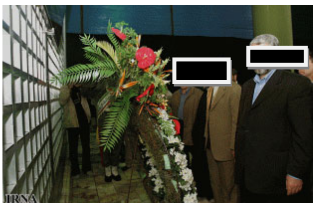
Figure 3 [Hamas Leaders, Ismā'īl Haniyeh and Khalid Mesh'al Visiting the Grave of Khomeini!? 2010]

Do you not view that al-Khomeini is of the biggest disbelievers in Allāh? So then what is your view on those who do not make takfeer of him? Such as Hamas who went to Iran 5 and placed roses on his grave and view him as the “spiritual father” of their da'wah (!?):